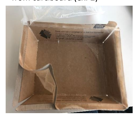
Separation plastic laminated film from cardboard (ex. 2)