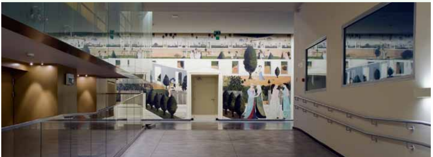
Square - Brussels Meeting Centre

→ Check our website for updates on this programme www.proeurope-congress.com