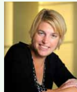
Joke Schauvliege Chair of the Environment Council under the Belgian EU Presidency