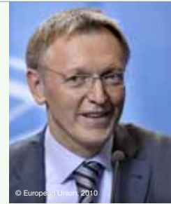
Janez Potočnik European Commissioner for the Environment